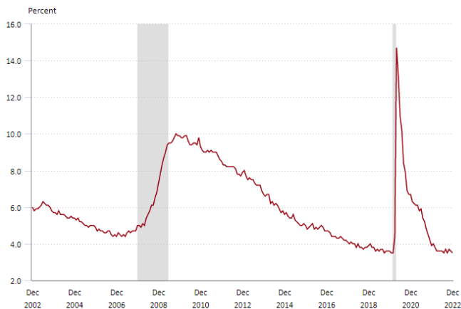
Figure 3. U.S. Unemployment (December 2002 – December 2022)